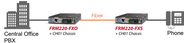
Figure 2 : Voice Transmission from 2km to 120km over fiber